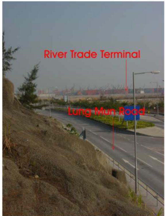
View B: LCU 2, Transport Corridor