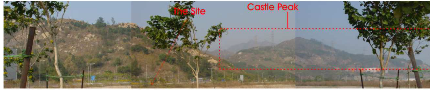
View A: LCU 1, Woodland, Grassland and Shrubland