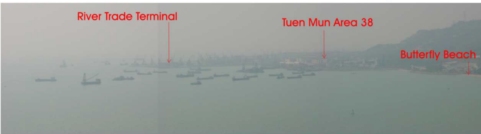
View D: LCU 5, Water Frontage