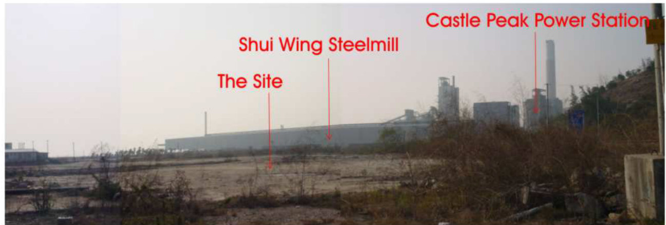
View C: LCU 3, Industrial Utility